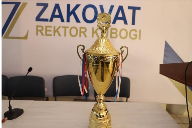
"RECTOR'S CUP": intellectual game "ZAKOVAT" ( https://telegra.ph/ZAKOVAT-DAVOM-ETADI-11-12 )