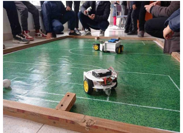
an exhibition in the direction of "Robotics" ( https://telegra.ph/Robototexnika-yonalishi-boyicha-korgazma-tashkil-etildi-11-17-2 )