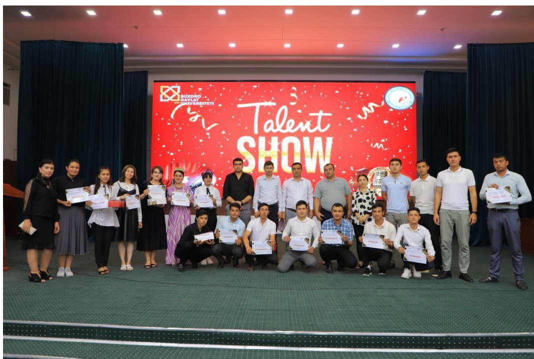
Talent show ( https://telegra.ph/TALANTLAR-SHOU-mega-tanlovi-bolib-otdi-05-27 )

In order to meaningfully organize the free time and develop the social activity of students, cultural and educational events and competitions are being held by the Youth Union Primary Organization of BSU.